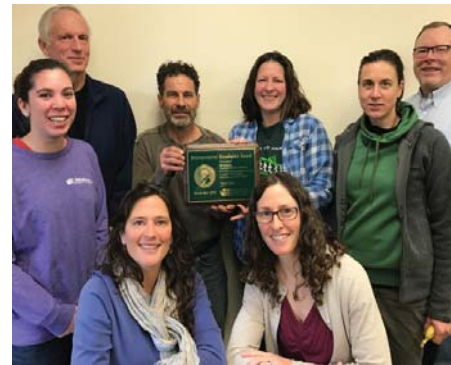
Whatcom CD was honored with an Environmental Excellence Award from Dept. of Ecology for services to the agricultural community

Key partners: Whatcom County Public Works, Ecology, City of Blaine, Whatcom County Health Department, Drayton Harbor Oyster Company, Drayton Harbor Shellfish Protection District, WSDA, Puget Sound Restoration Fund, Port of Bellingham, Drayton Harbor Community Oyster Farm, Nooksack Indian Tribe, and Whatcom County Planning and Development Services