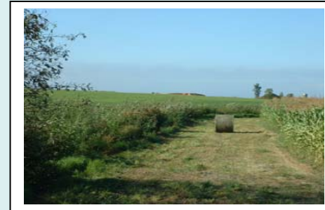
Hedgerow and filter strip planted after drainage maintenance.